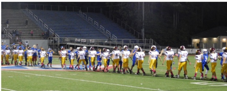
The teams, coaches and cheerleaders shaking hands after the game

The game had a playoff feel to it with scoring back and forth, and even though the final play came up short for Lassiter, it was certainly anyone's game to win. The teams lined up along with the coaches and cheerleaders and shook hands after the game with their opponents. As some of the pictures show, this game had friends and rivals playing a great football game and proudly showing the spirit of the Cobb Football League.